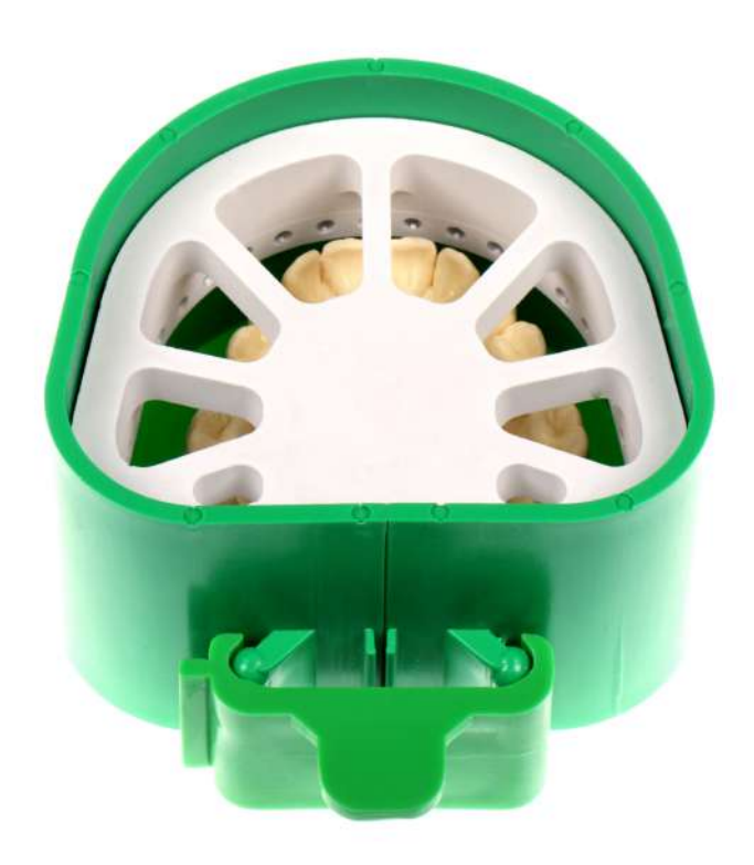
Fig 6 The plaster-stabilizer in position with the Silflex-Flask (DeguDent).