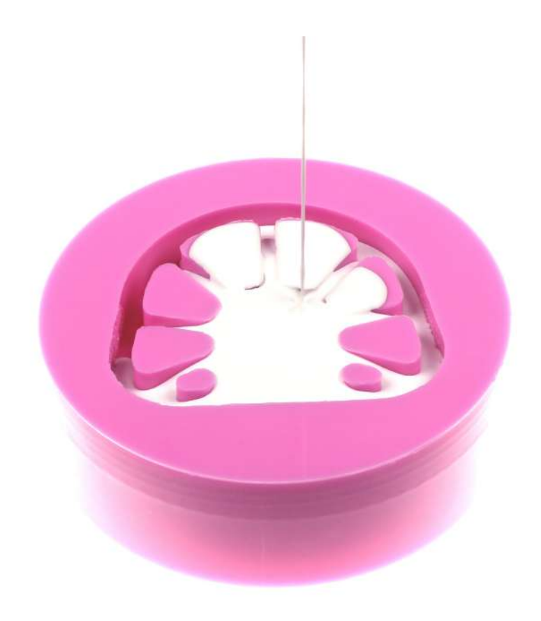
Fig 2 Silicone form filling with plaster