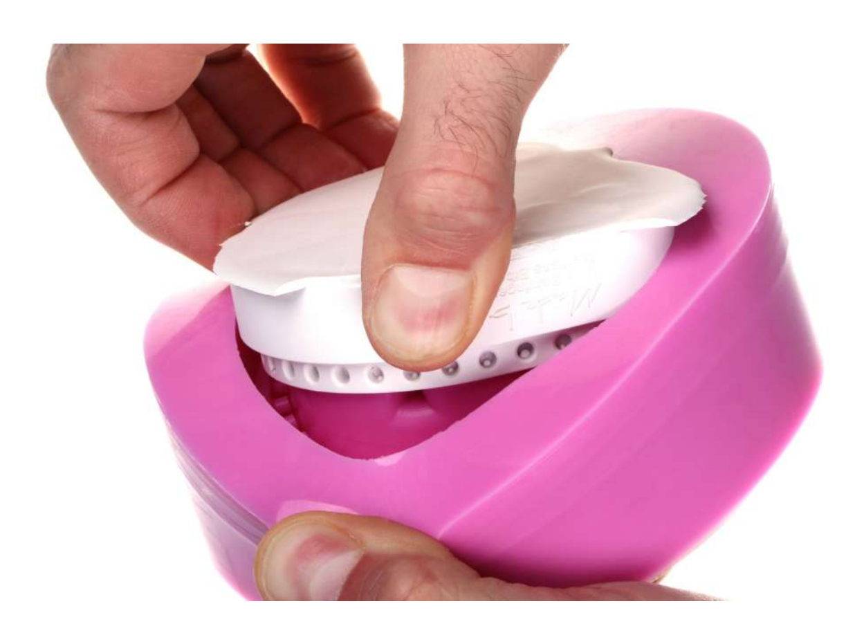
Fig 3 removal of the hardend raw plaster-stabilizer.