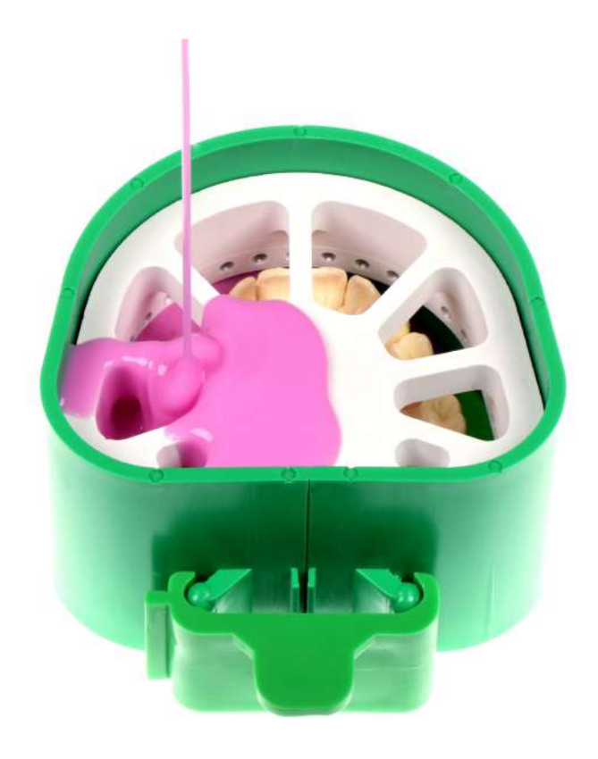
Fig 7 filling the flask with duplication silicon