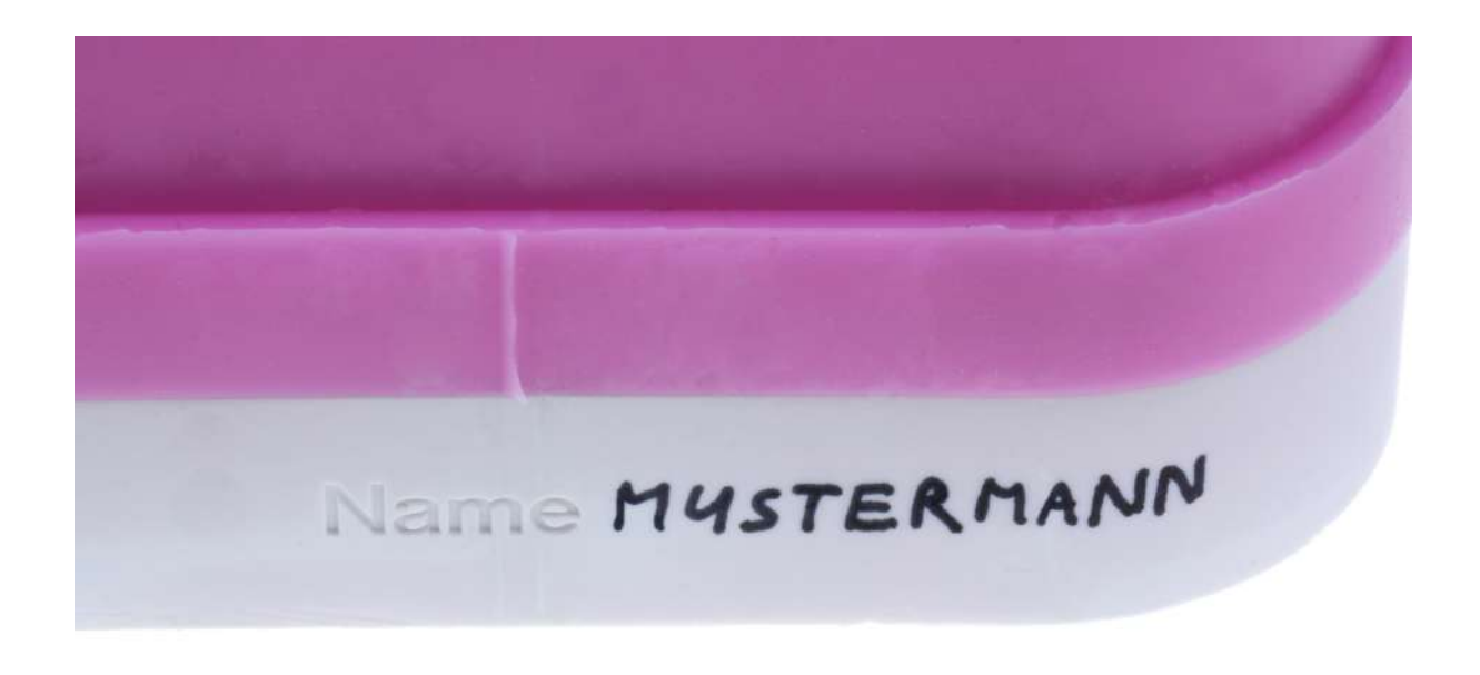
Fig 9 After resetting to the starting position the duplication is ready for filling with refractory material/plaster/synthetic resin and can be easily labelled and archived.