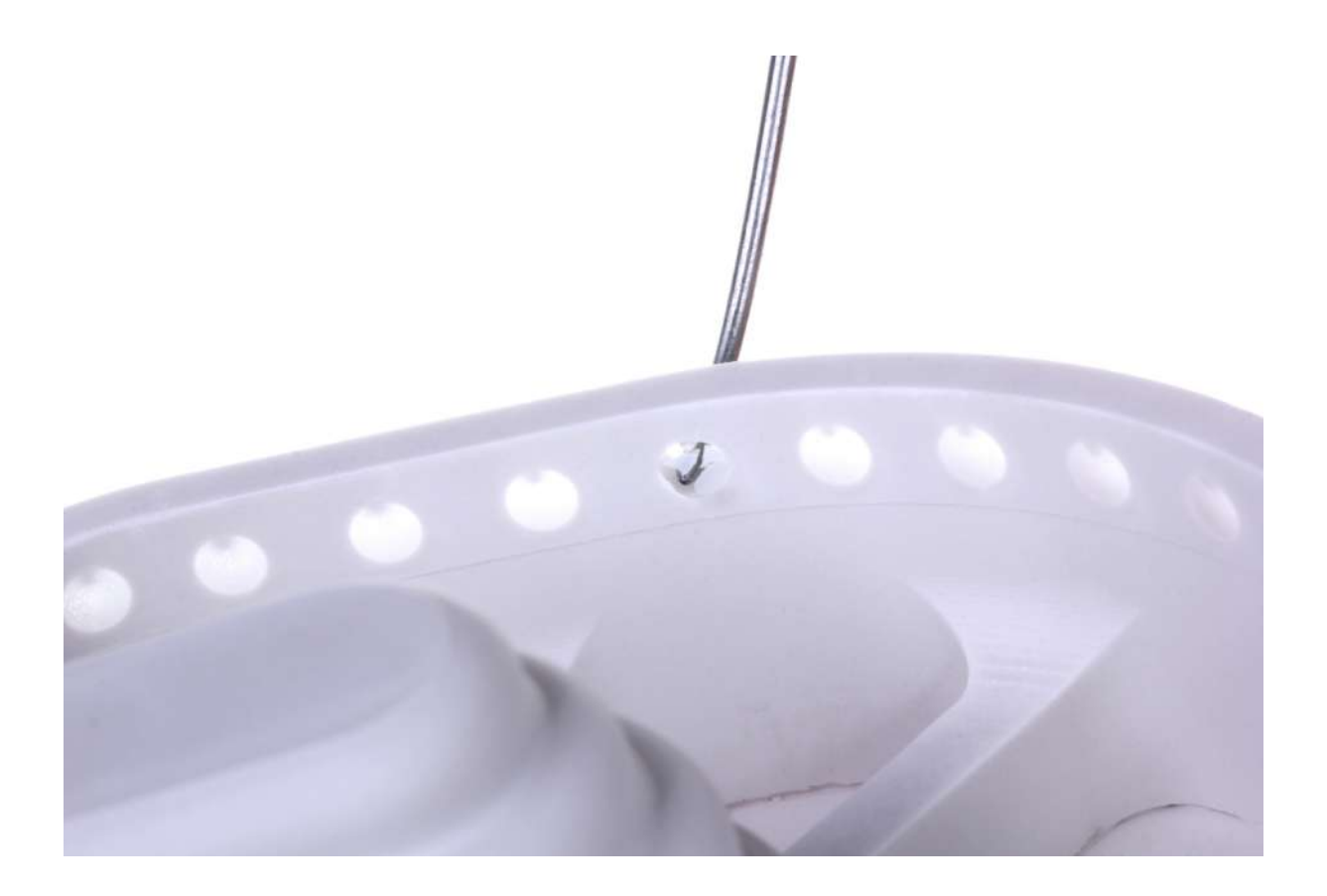
Fig 4 retention windows are pierced with a pointy instrument.