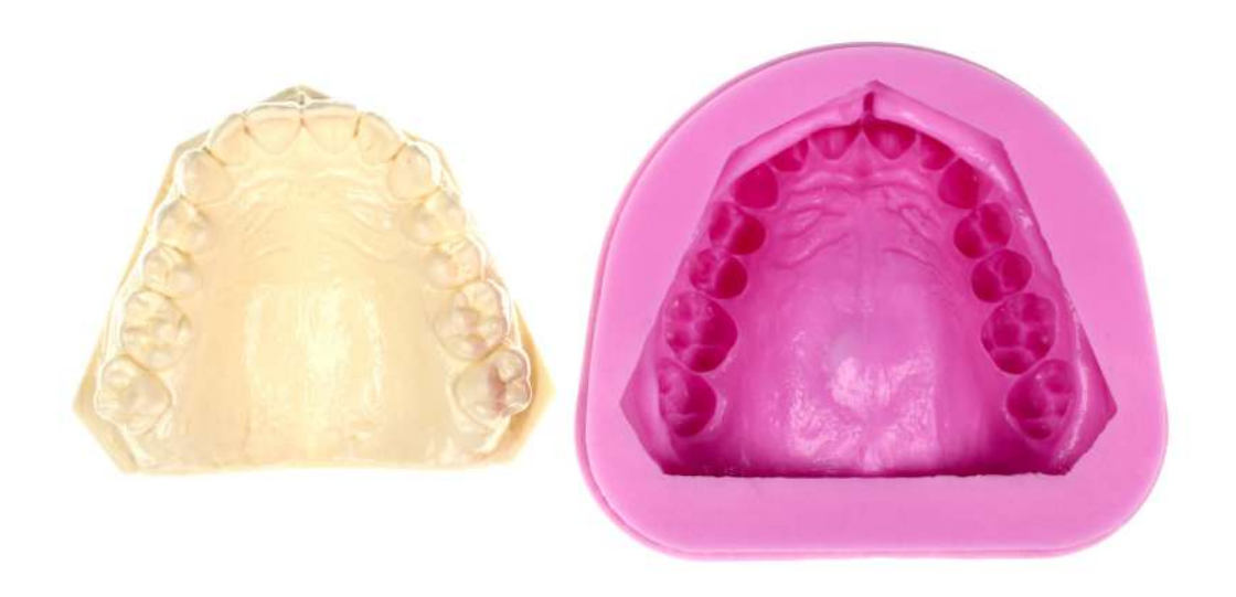
Fig 8 The finished silicon-form of the master-model stabilized with the plaster-stabilizer.